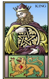
King of Pentacles

Make some notes below on your considerations