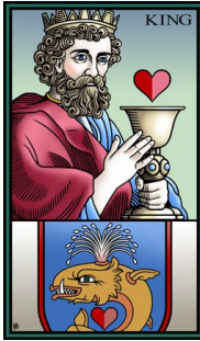
King of Cups