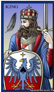
King of Swords