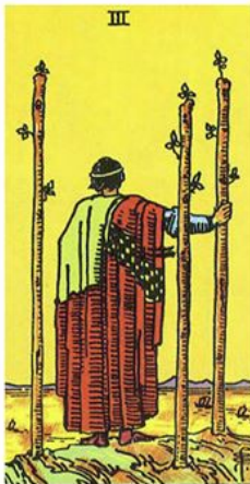
3 of Wands