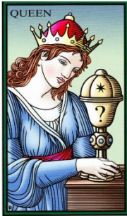
Queen of Cups